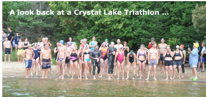
A look back at a Crystal Lake Triathlon ...

Contact us for more details at crystallakecommunityassoc@gmail.com